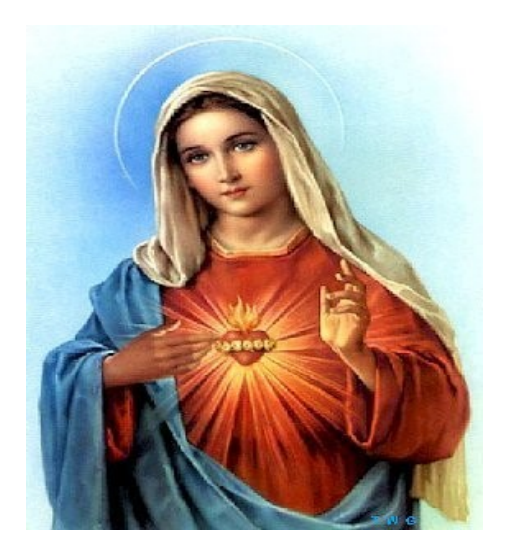
Immaculate Heart of Mary pray for us.

Sacred Heart of Jesus, I place my trust in you.